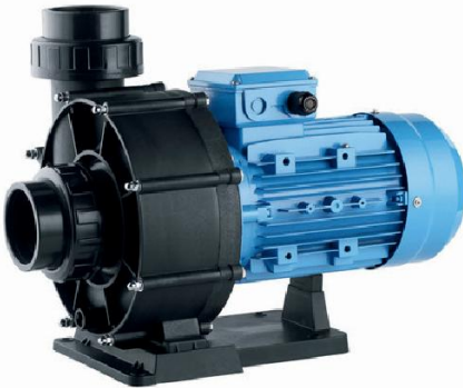
BWSP0300/0400/0550 Single-stage centrifugal pumps Connection Size: 75MM